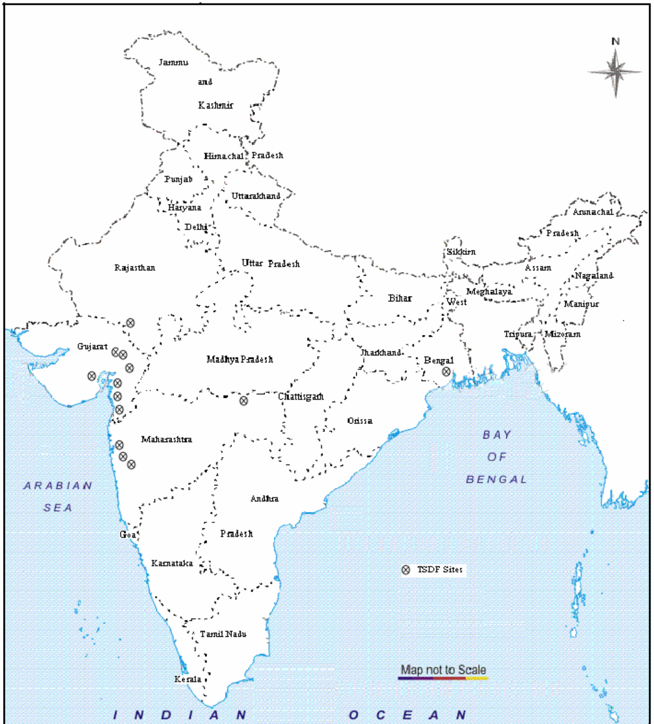
Locations showing Common Hazardous Waste Treatment & Disposal Facility (TSDF)