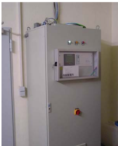
Figure 1: AMESA control cabinet

The functional principle of the AMESA® system was described in several publications 2,3 . In principle the used method complies with the cooled probe method of EN-1948 with the exception that the condensate flask is installed after the XAD-II cartridge and that therefore the condensate does not need to be collected and analysed. This is in accordance to US EPA method 23A. Additionally the plane filter for the dust collection is replaced by