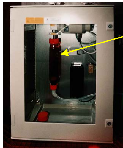
Cartridge box with XAD II cartridge